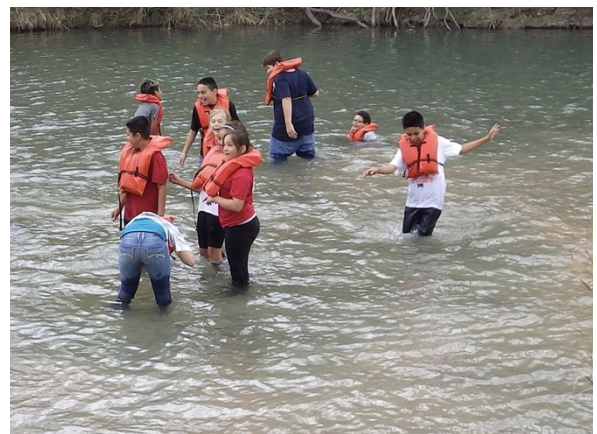
A popular tradition of Outdoor School is 'splash time' at the end of the lesson