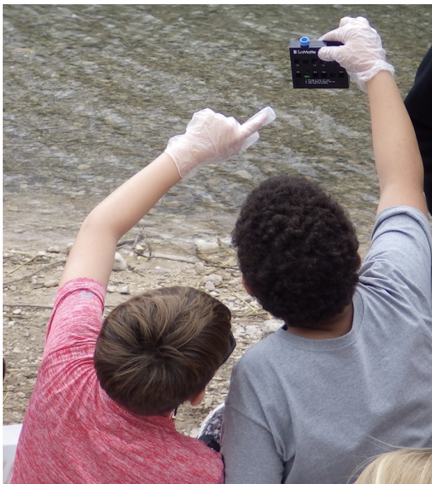
Students determine the pH of the water