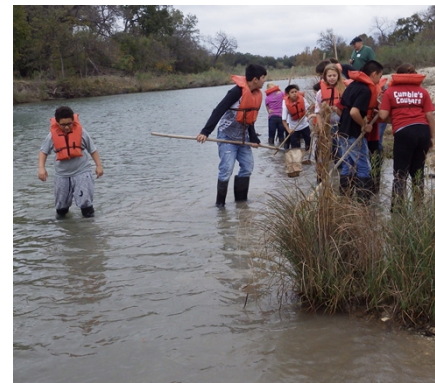
Students sample for macroinvertebrates to ascertain the health of the river