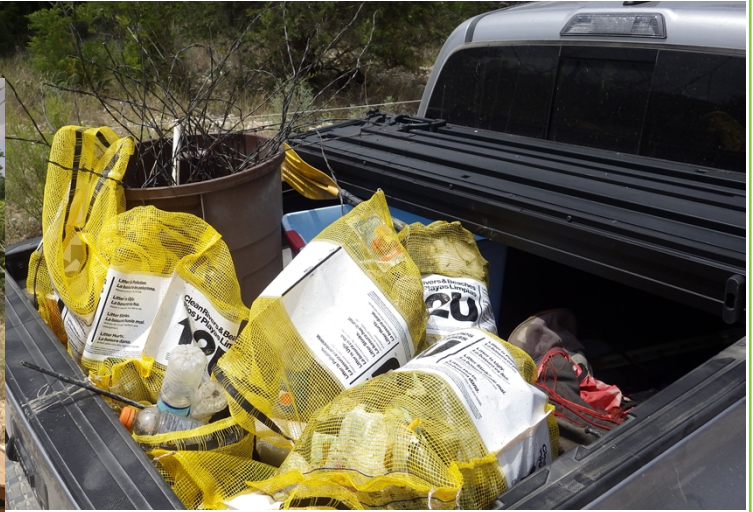
The day's haul from the South Llano and Boone's Crossing

A special thank you to South Llano River State Park for help installing the kiosk! Saved everyone a lot of digging.