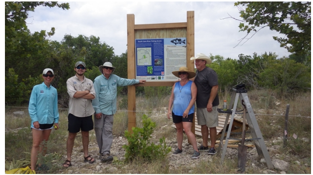
Mission Accomplished – well almost. Kiosk roof to be added once concrete sets.

A special thank you to South Llano River State Park for help installing the kiosk! Saved everyone a lot of digging.