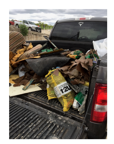
Avocado spill debris

If you appreciate and support our efforts, please consider joining for $20 or becoming a sponsor for $100. It is up to all of us to steward this great resource.