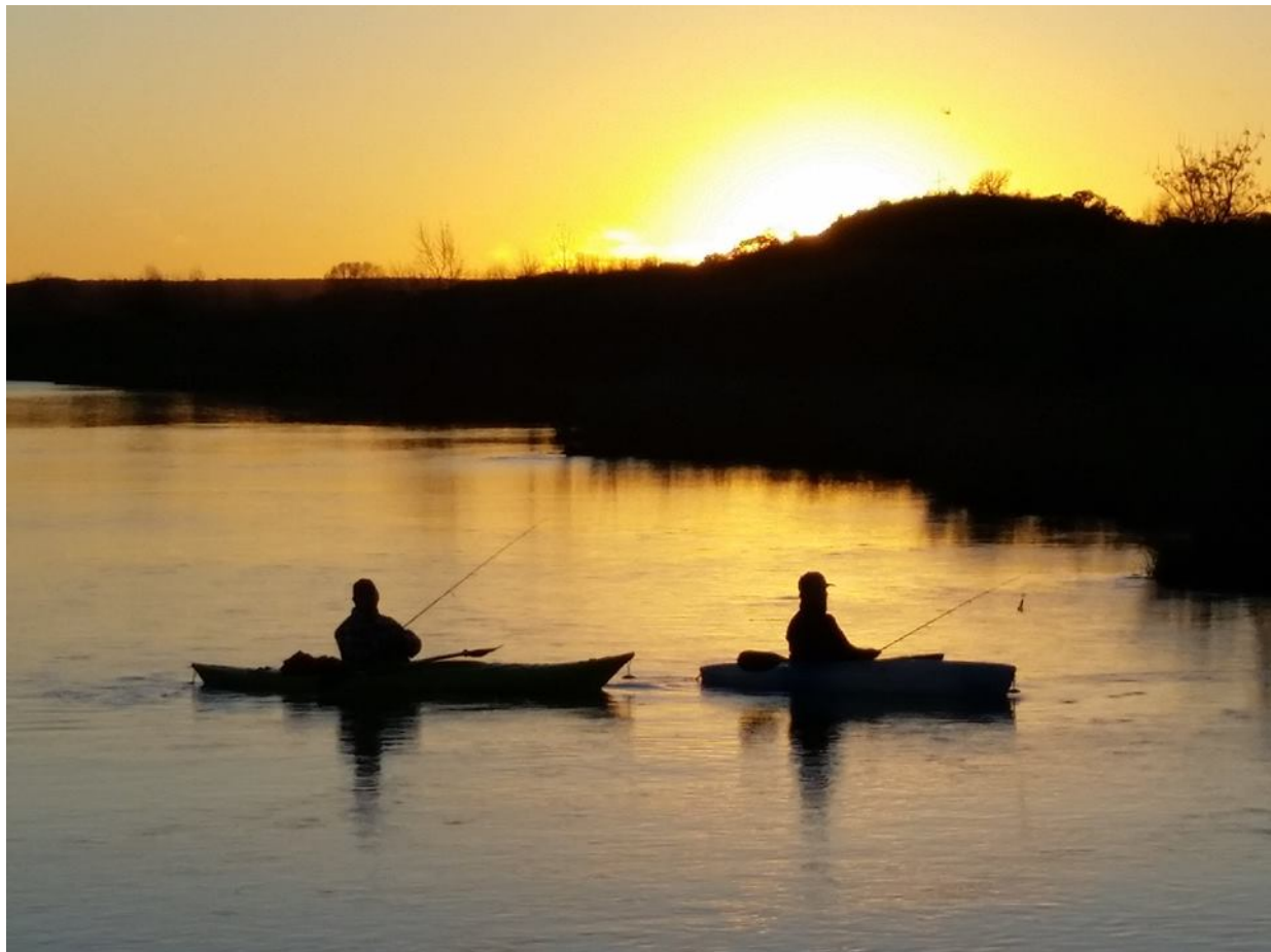
Fishing the Llano at Sunset above Martin's Crossing in Mason County