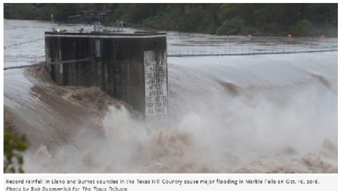
Record rainfall in Llano and Burnet counties in the Texas Hill Country cause major flooding in Marble Falls on Oct. 16, 2016.

The heavy rainfall and subsequent flooding Central Texas faced a few weeks ago broke records and serve as an important reminder about the connection between land and water. ...Over 2 million people live in the Colorado River watershed, and many of the communities within it depend on the river for their municipal water...its total watershed area covers 15% of Texas.